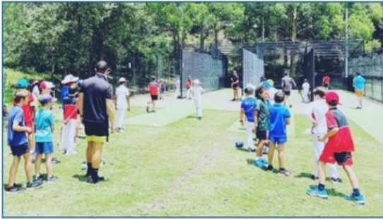
JULY SCHOOL HOLIDAY CAMPS Early bird discount available - See website for details!

July is usually reserved for winter sports, but if you are serious about your cricket or want to see a massive improvement in your game next season, this is the time you need to be practising! Elite Cricket's awesome team of coaches will provide a fantastic experience in a fun environment for you to go to the next level.