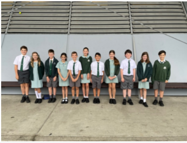
The school leadership team.